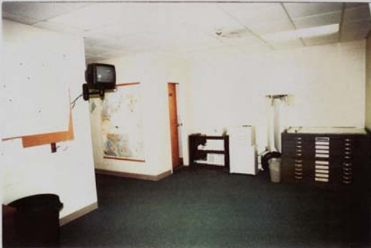
2. INTERIOR VIEW OF OFFICE BUILDING