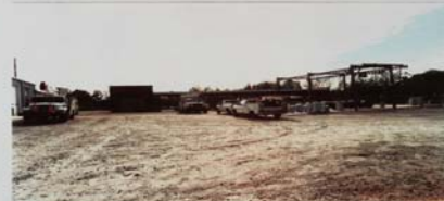
10. VIEW OF PARKING AREA