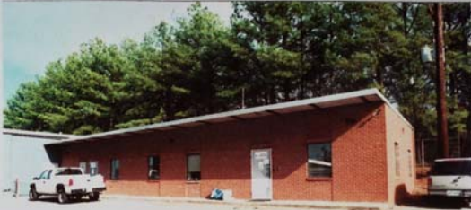
1. FRONT VIEW OF OFFICE BUILDING