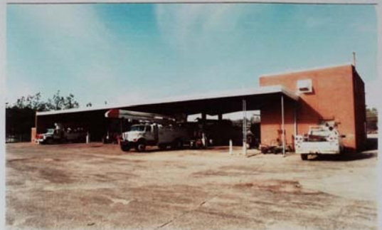
7. VIEW OF COVERED PARKING AREA