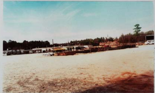
8. VIEW OF PARKING AREA