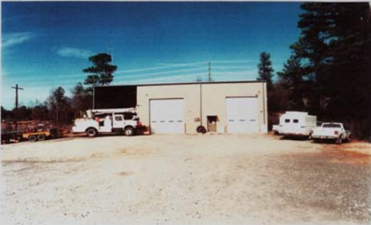
5. VIEW OF MAINTENANCE BUILDING