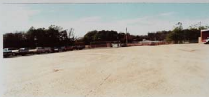
9. VIEW OF PARKING AREA