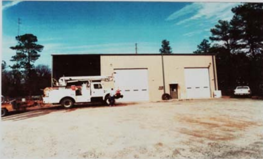
6. VIEW OF MAINTENANCE BUILDING