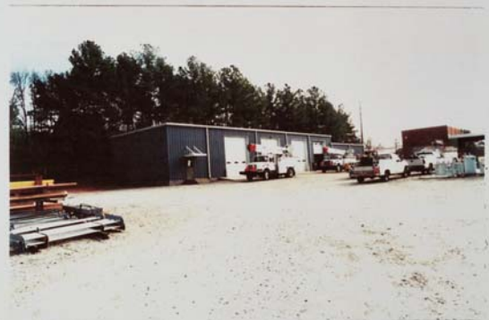
4. VIEW OF MAINTENANCE BUILDING