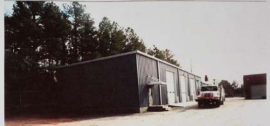
3. VIEW OF MAINTENANCE BUILDING